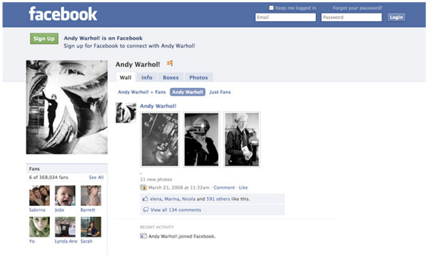
Screenshot of Andy Warhol's Facebook page.

Throughout the modern era, we saw all our traditions and inherited lifestyles condemned to decline and disappearance. But neither do we today trust our present time – we do not believe that its fashions, lifestyles, or ways of thinking will have any kind of lasting effect. In fact, the moment new trends and fashions emerge, we immediately imagine that their inevitable disappearance will come sooner rather than later. (Indeed, when a new trend emerges, the first thought that comes to one’s mind is: but how long will it last? And the answer is always