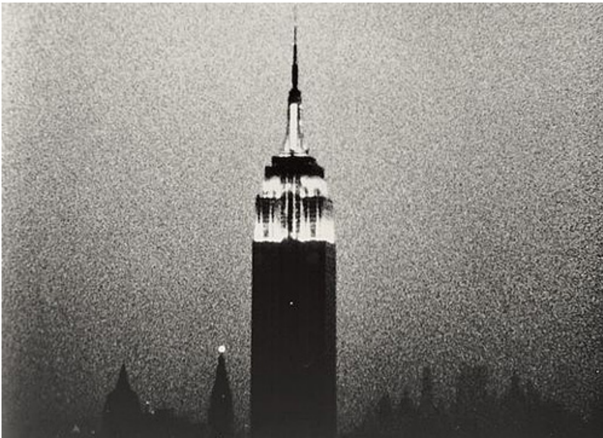
Andy Warhol, Empire , 1964.

This radical reduction of artistic tradition had to anticipate the full degree of its impending