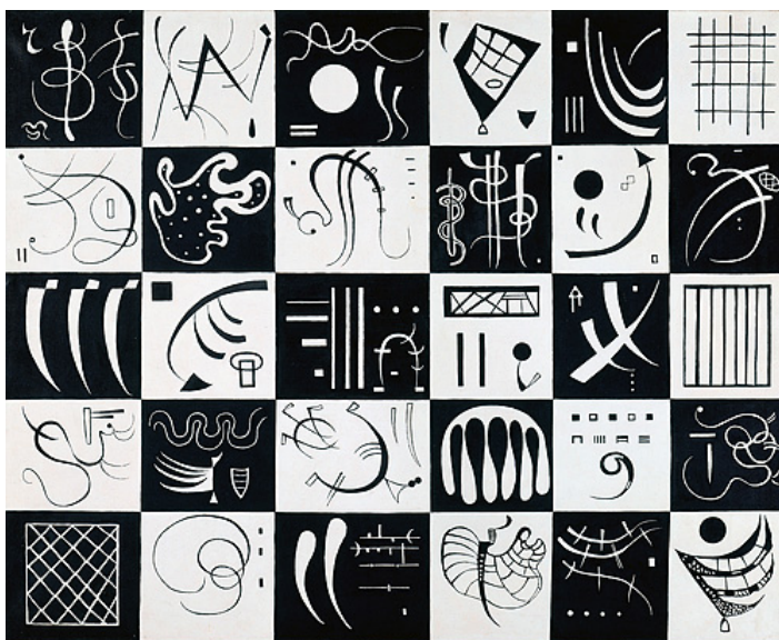
Wassily Kandinsky, Thirty (Trente) , 1937. Oil on canvas.

That means that the weak, transcendental artistic gesture could not be produced once and for all times. Rather, it must be repeated time and again to keep the distance between the transcendental and the empirical visible – and to resist the strong images of change, the ideology of progress, and promises of economic growth. It is not enough to reveal the repetitive patterns that transcend historical change. It is necessary to constantly repeat the revelation of these patterns – this repetition itself should be made repetitive, because every such repetition of the weak, transcendental gesture simultaneously produces clarification and confusion. Thus we need further clarification that again produces further confusion, and so forth. That is why the avant-garde cannot take place once and for all times, but must be permanently repeated to resist permanent historical change and chronic