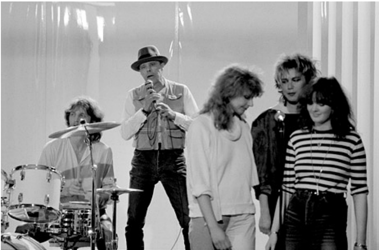
Joseph Beuys performing "Sonne statt Reagan" in 1982.

Now the claim that art is a form of knowledge is by no means new. Religious art had a claim to present the religious truths in a visual, pictorial form to a spectator who could not contemplate them directly. And traditional mimetic art pretended to reveal the natural, everyday world in a way in which the common spectator could not see it. Both of these claims were criticized by many thinkers, from Plato to Hegel. And both were endorsed by many others, from Aristotle to Heidegger. But whatever one